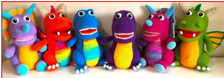
Chomp, Munch and Scorch