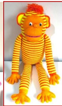
Monkey or ape