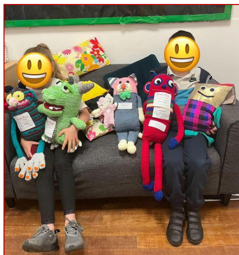
NB. Children's faces are blocked by request

Please pass on my thanks to all the knitters - what talent, and what generosity! Many thanks to everyone involved.